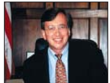
JEREMY HARRIS, Mayor City and County of Honolulu

On behalf of the citizens of the City and County of Honolulu, I extend best wishes for a successful conference and invite you to explore our tropical gardens, lush rainforests, miles of sandy beaches, other outdoor adventures, and outstanding attractions that Hawaii offers.